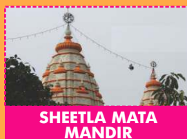
SHEETLA MATA MANDIR