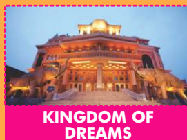
KINGDOM OF DREAMS