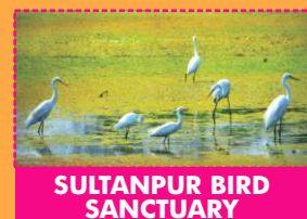
SULTANPUR BIRD SANCTUARY